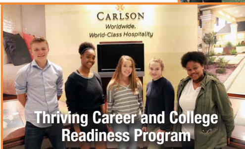
Thriving Career and College Readiness Program