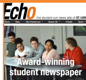
Award-winning student newspaper

Named 28th Best College Prep High School in Minnesota by Niche