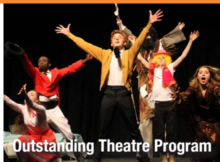
Outstanding Theatre Program